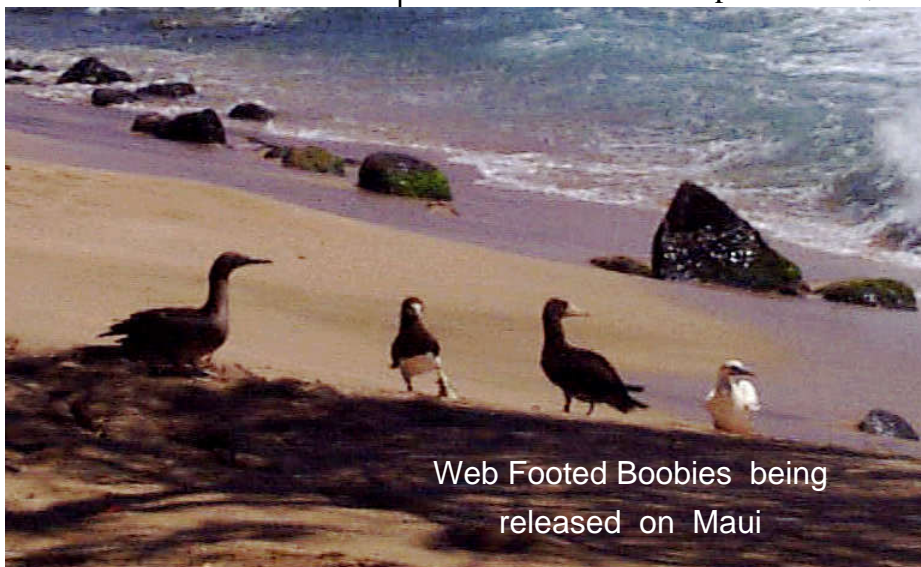
Web Footed Boobies being released on Maui

of three hose systems that connect to the Single Point Mooring at Tesoro's Hawaii Refinery, was leaking oil. All identifiable free floating oil was collected by the second day with no land impact on Oahu. However, some oil apparently was carried below the surface and showed up on Kauai two weeks later. Approximately 45 sea birds, primarily long distance Boobies, were oiled offshore and showed up back on the coastlines of several islands. These birds were collected and cleaned in the first organized Hawaii oiled wildlife response in many years. Tesoro, CIC, the State of Hawaii, IBRRC, Sea Life Park, USFW, and others worked together to clean and rehabilitate the birds. Over 30 birds were cleaned and released.